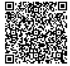
BR3QS4-WR553GQL Issued: Wed Aug 03, 2022 3:29 PM

Thunder Bay: Ontario Northland Bus Terminal