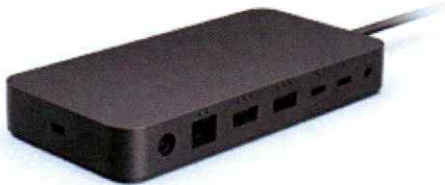
Surface Thunderbolt™ 4 Dock CAD $409.99

Elevate your workspace with Surface Thunderbolt™ 4 Dock, delivering ultra-high speed data transfer. Eight versatile connections power your webcam, phone, and other