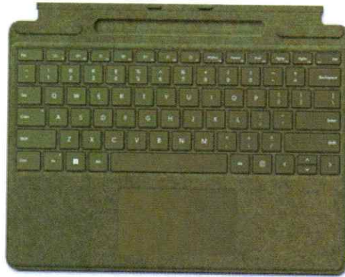
Surface Pro Signature Keyboard CAD $229.99

Elevate your workspace with Surface Thunderbolt™ 4 Dock, delivering ultra-high speed data transfer. Eight versatile connections power your webcam, phone, and other